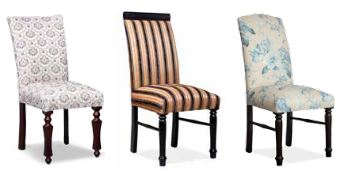
CAPTION: From left to right: The Windsor dining chair retails for R2 495 each, the Apollo dining chair retails for R2 495 each, and the Sheraton dining chair retails for R1 995 each – all from Rochester (www.rochester.co.za).