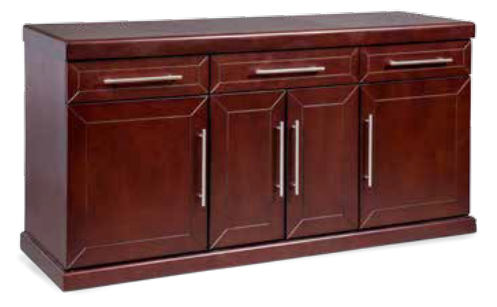
CAPTION: The Windsor sideboard retails from R13 995 from Rochester stores (<u>www.rochester.co.za</u>).