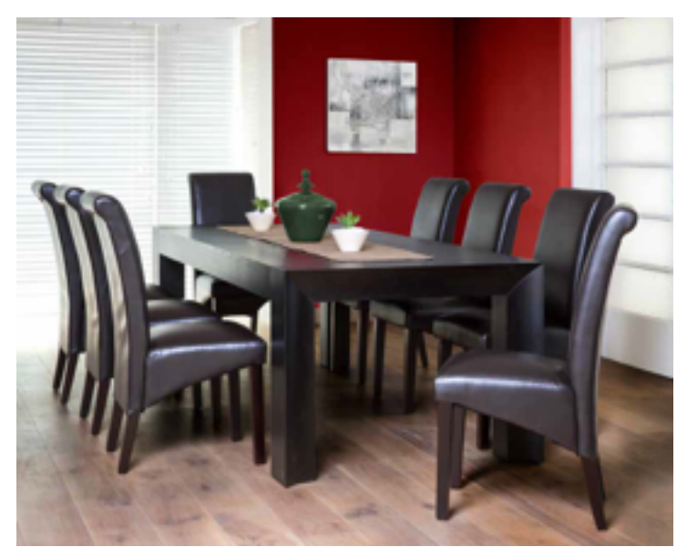
CAPTION: The Caserta dining table with 8 Stacey chairs that retails for R13995 from Rochester stores (www.rochester.co.za).

The Caserta dining table for example can seat up to eight people at a time, whilst the Augusta Gathering table extends to accommodate more people as and when required. "There is a growing emphasis on the importance of transforming ones home to suit a family's evolving needs, and to make space to reconnect with each other," notes Thiart.